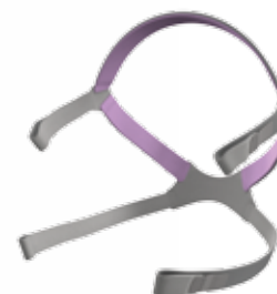
AirFit N10 for Her headgear 63261 (Sml)