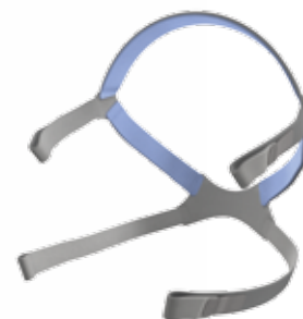
AirFit N10 headgear 63262 (Sml) 63260 (Std)